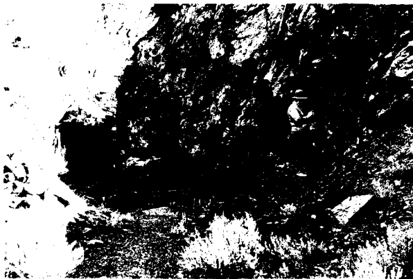
Portal lower adit. "Blob" of manganeseiferous ore in shadow. Note shaft.