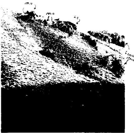
General View showing three adit levels and outcrops