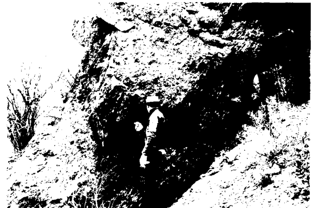
Outcrop of manganeseiferous ore (siliceous) near upper tunnel.