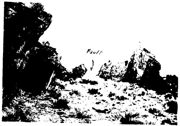
Outcrops near top of ridge. See picture below--Note parallel "kidneys"