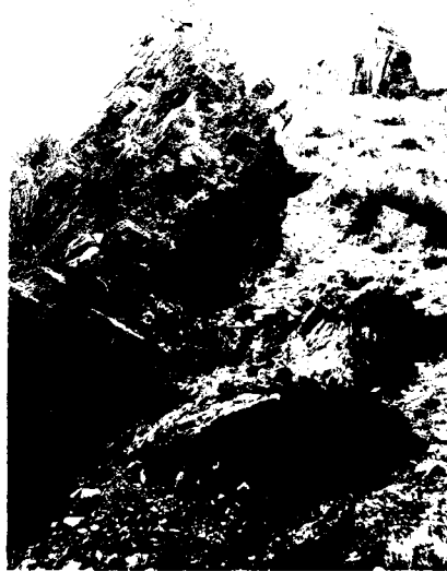
Outcrop of manganeseiferous ore along limestone shale contact.