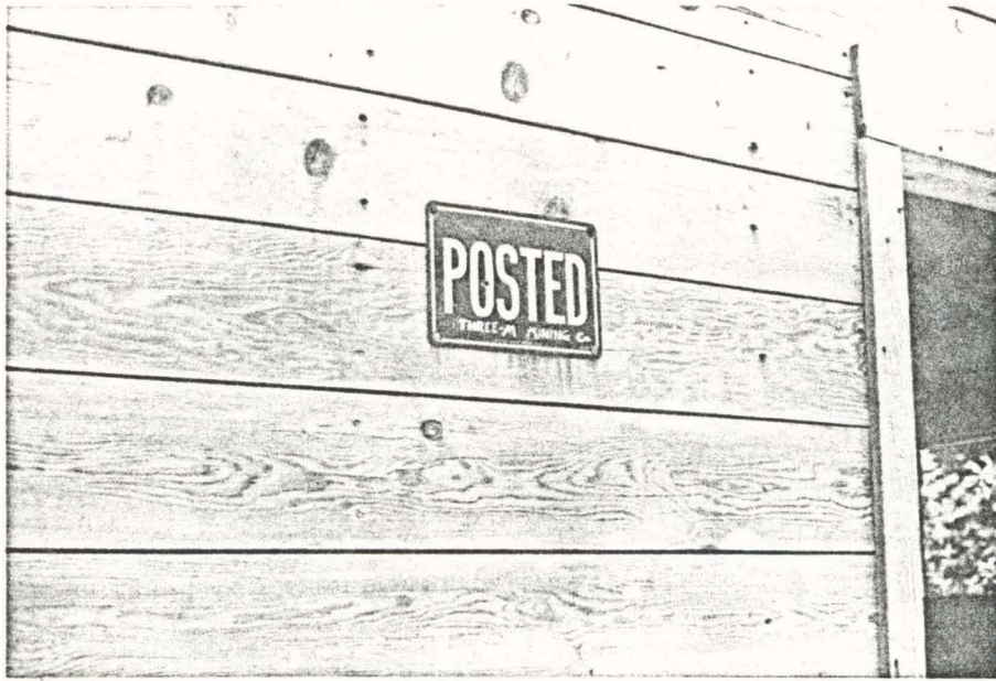
1. A closeup view of the cabin.