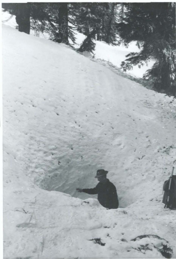
Largest melt hole