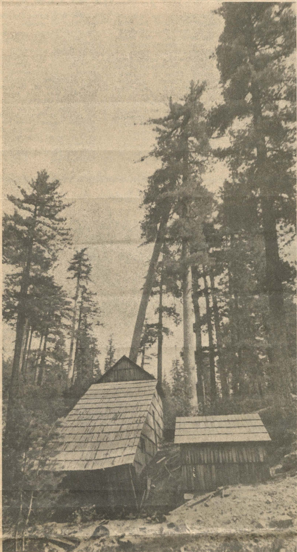
THE LAND tilts one way, buildings another, trees a third.