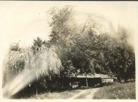
OAK FLAT RANCH HOUSE