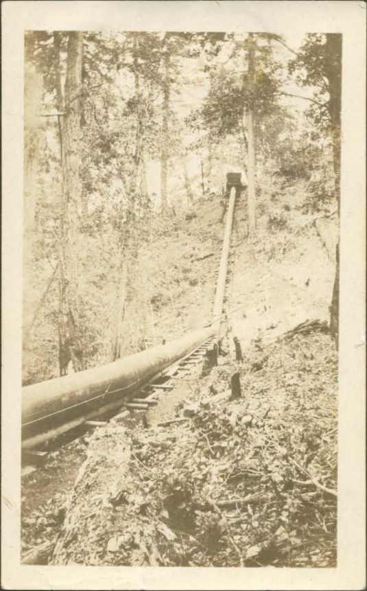
PENTSTOCK AND PIPE