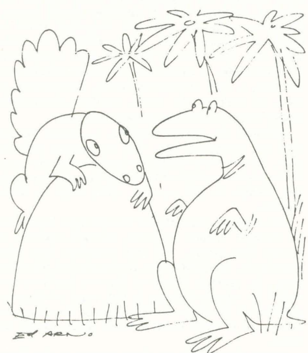
"It could never work out for us; you're at the end of the Pleistocene period, and I'm at the beginning of the Mesozoic period."

The announcement in Ketchikan revealed results of an extensive exploration program conducted in Southeast Alaska over the past five years. The mineralized area was first discovered in the fall of 1974. The area covers almost one square mile and is located 45 miles east of Ketchikan at an elevation of 2,000 feet, five miles inland from tidewater. Drilling to date, according to company officials, indicates a potential ore body in excess of 100 million tons, most of it near the surface, which would permit open pit mining. The potential