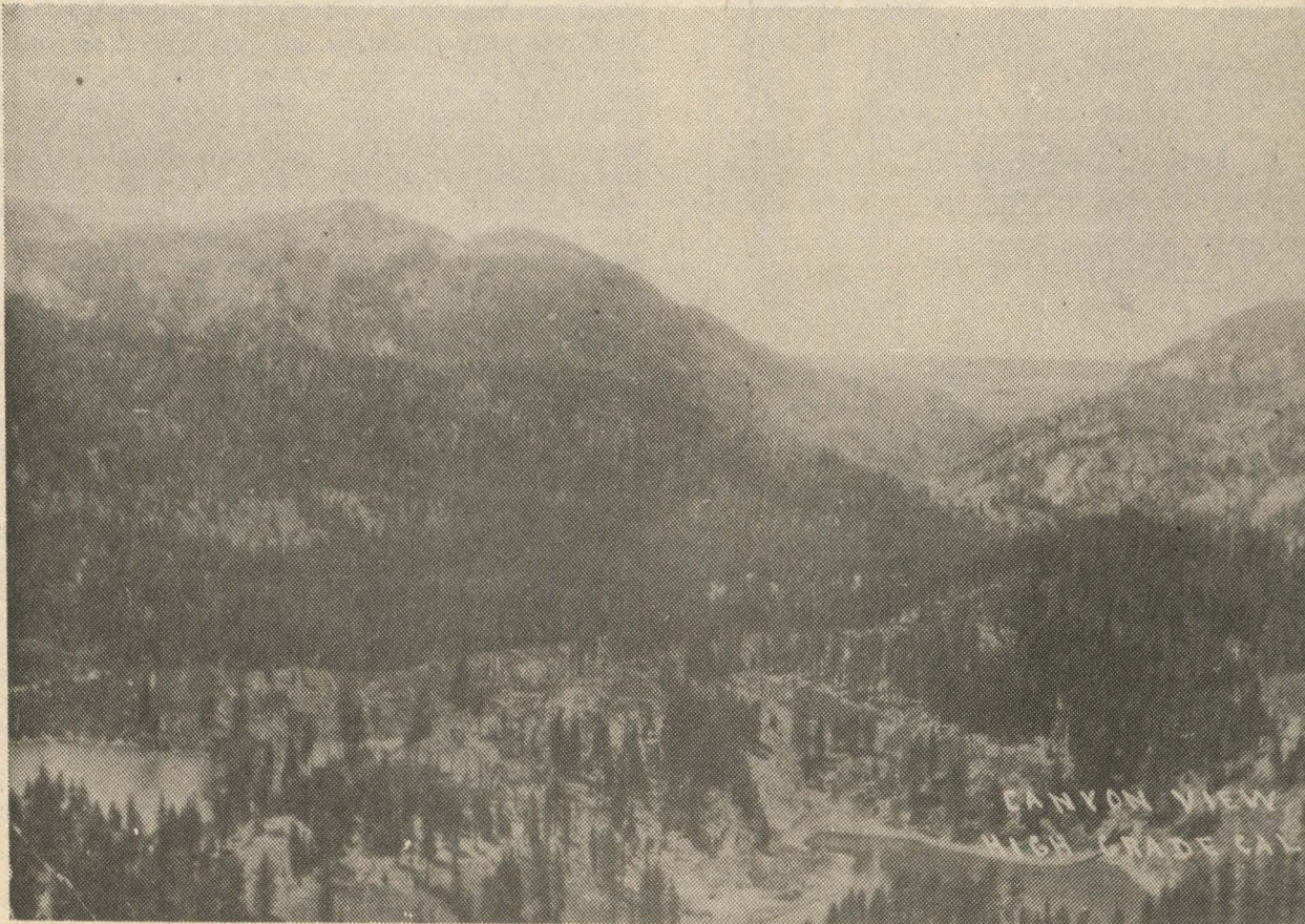
Canyon view of once active High Grade mining area near Fort Bidwell

THE FORTHCOMING BOOM WILL UNQUESTIONABLY SEE SHARP ADVANCES, THE FIRST EFFECT OF WHICH WILL BE FELT BY THE VERY BEST CLASS OF SECURITIES. ACT.