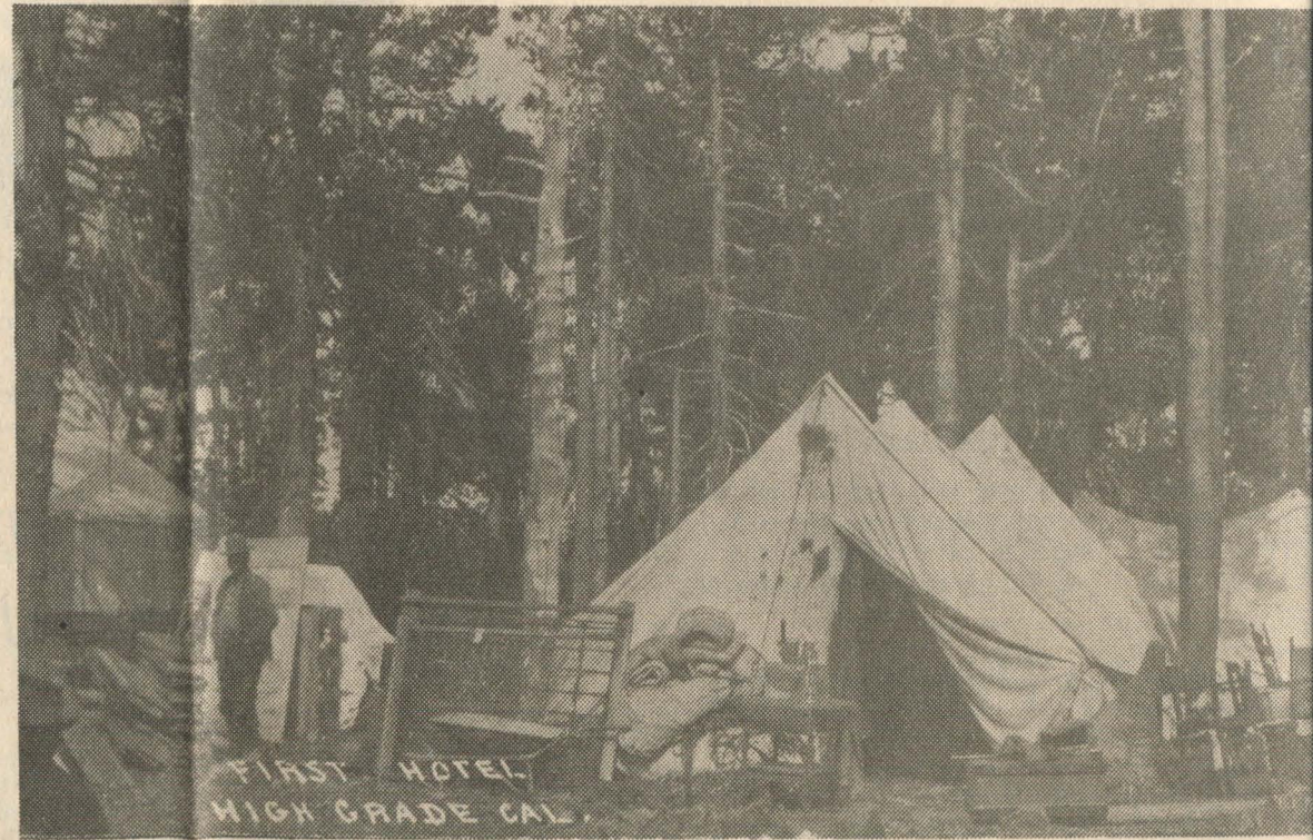
High Grade's "first hotel" wasn't like staying in downtown San Francisco

The passing of the snow and the baring of the surface of the golden hills of High Grade, will in the opinion of the best informed authorities on the camp, be the means of creating a veritable craze among the newcomers, and the consequent report of rich discoveries will be the signal for the big stampede, which is to be a record breaker in the history of new gold camps.