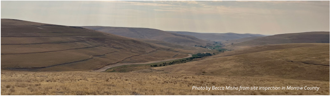
from site inspection in Morrow County