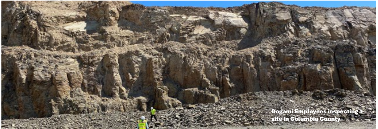
Dogami Employees inspecting a site in Columbia County