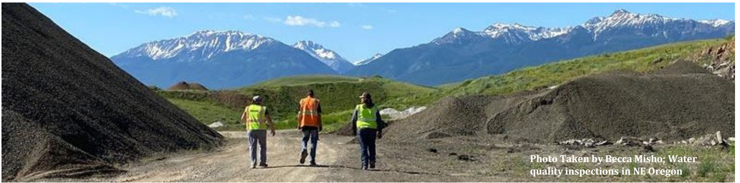
Water quality inspections in NE Oregon