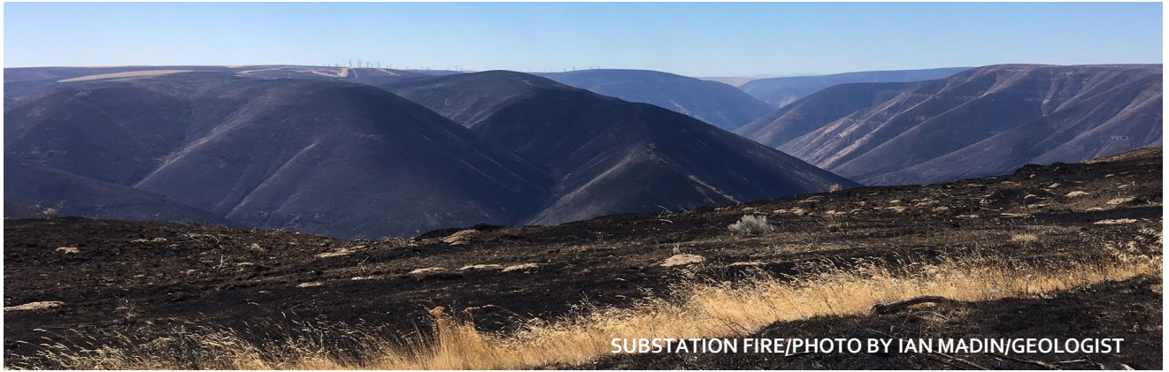
SUBSTATION FIRE/PHOTO BY IAN MADIN/GEOLOGIST