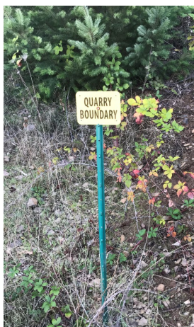
*Pictures shown are examples of approved site boundary markings as seen in the field.

DOGAMI understands that there are site specific scenarios that warrant waiving the marking requirements. Those include but are not limited to the markings being in the middle of an active agricultural operation or in the middle of an existing road, private or public. If you think that there are portions of your site boundaries where permanent marking is not possible or does not make sense, please submit a marking waiver request. This request must include a narrative justifying the marking waiver and a map identifying the portions of the boundaries not being marked. DOGAMI may also grant extensions for marking areas that are subject to a phased operation plan.