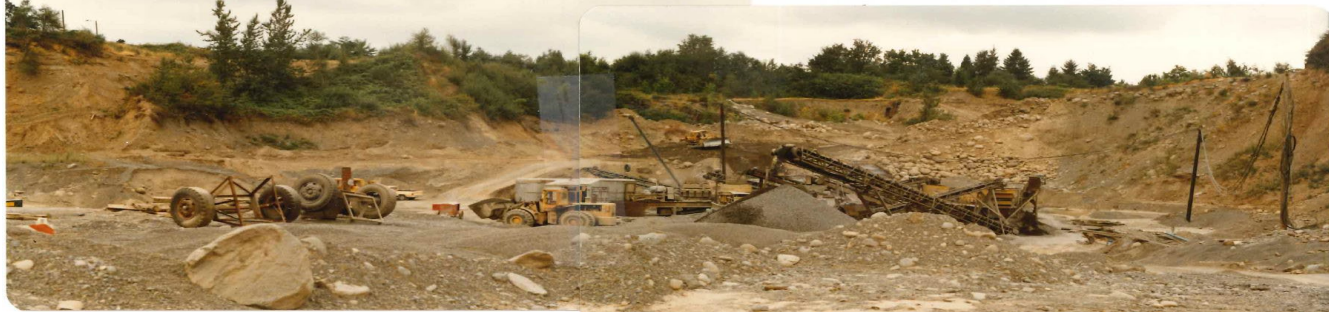
Historic Site Picture from August of 1984 in Multnomah County