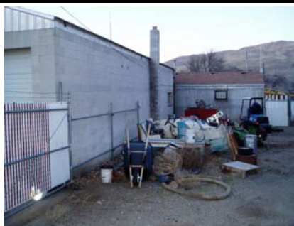
N General Site