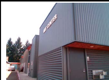
E Elevation View