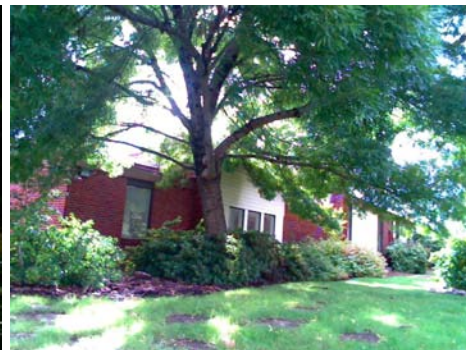
NE Elevation View