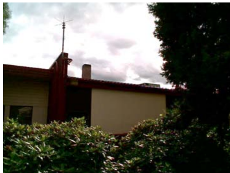
N Other BRICK WALL