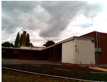
S Plan Irregularity Primary