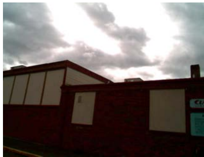
E Primary Structural Type AND CHIMNEY