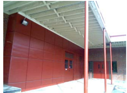
S Secondary Structural Type CONC BOILER RM, FALLING HAZ