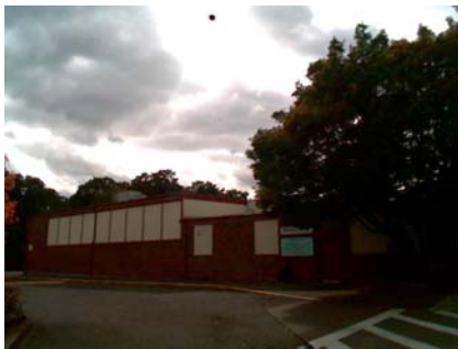
E Vertical Irregularity Primary