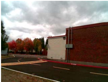
SE Plan Irregularity Primary AND MORE WOOD