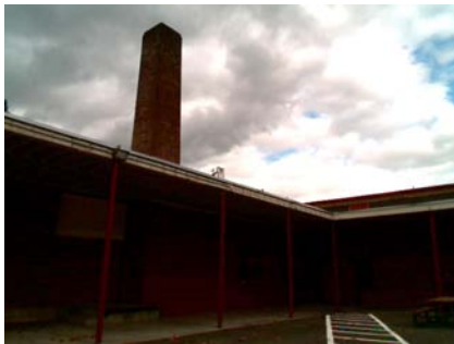
SW Falling Hazard