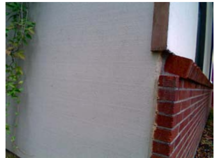
W Primary Structural Type