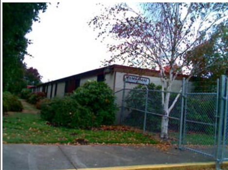
NW Elevation View