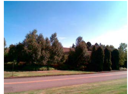
W Vertical Irregularity Primary