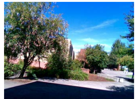
SE Plan Irregularity Primary