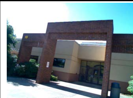
E Secondary Structural Type