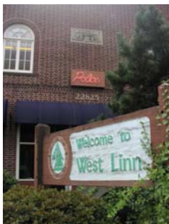
S General Site