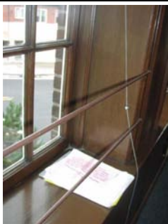
S General Site