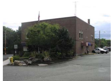
S General Site