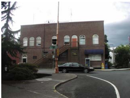
S General Site