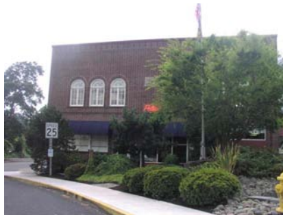
S General Site