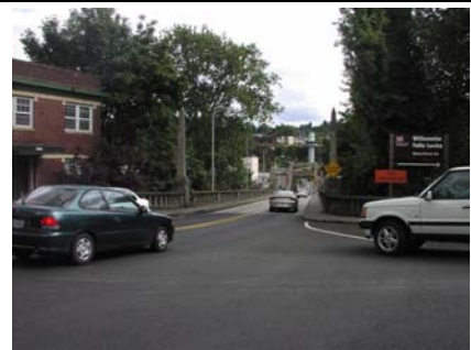
S General Site