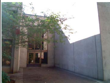
N Vertical Irregularity Primary N WING CONN TO CTR