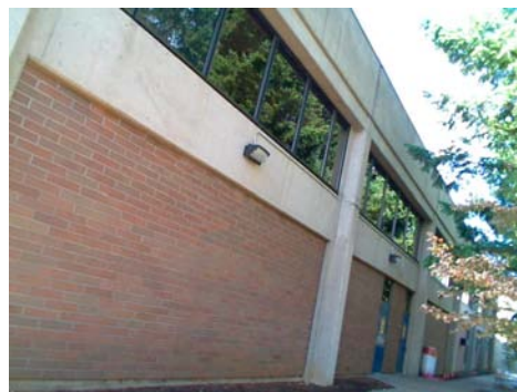
N Vertical Irregularity Tertiary SC AT WINDOWS, INFILL PANELS BELOW