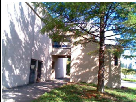
SE Pounding Potential CONN TO BLDG?