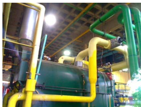
NW Vertical Irregularity Secondary 2 STORY BOILR RM SPACE IN N END OF CTR