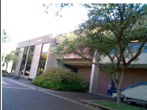
SW Elevation View