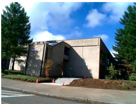
E Elevation View N WING