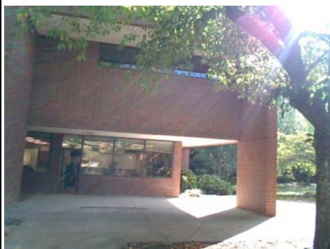
SW Elevation View