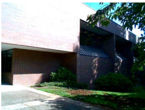
SW Elevation View S END OF CTR