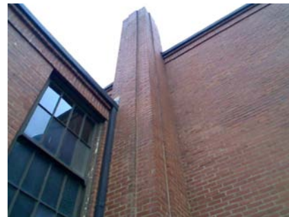
SE Falling Hazard