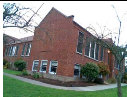
SW Falling Hazard