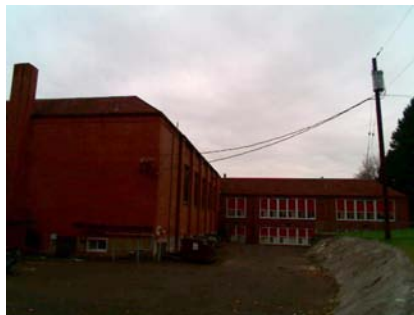
SE Plan Irregularity Primary