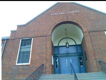
W Falling Hazard