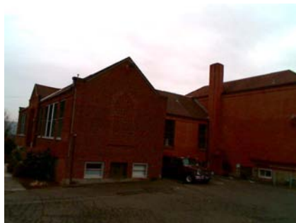
SE Vertical Irregularity Primary