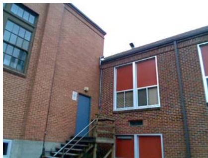
SE Primary Structural Type oldest brick on left