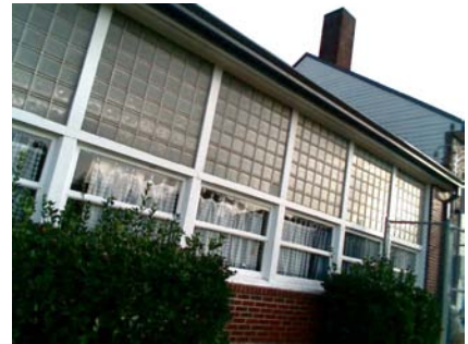
W Primary Structural Type