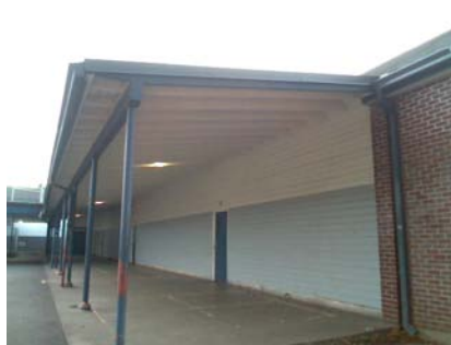
NE Primary Structural Type