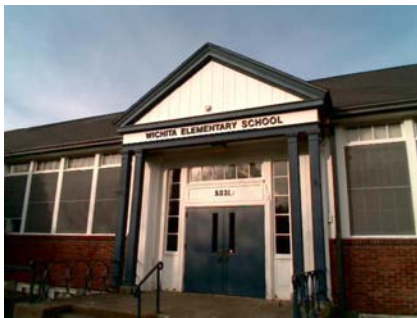
S Falling Hazard