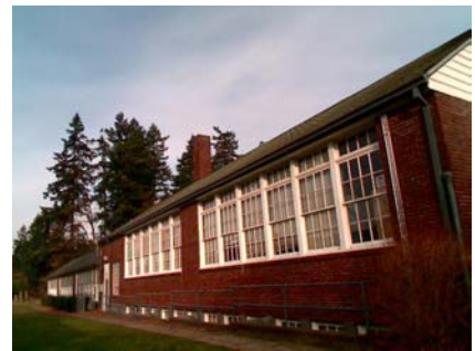
SW Falling Hazard