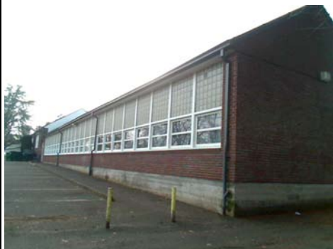
NW Plan Irregularity Secondary