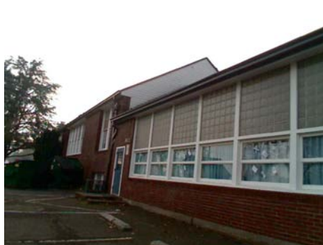
NW Vertical Irregularity Primary