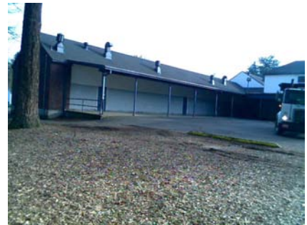
NW Primary Structural Type