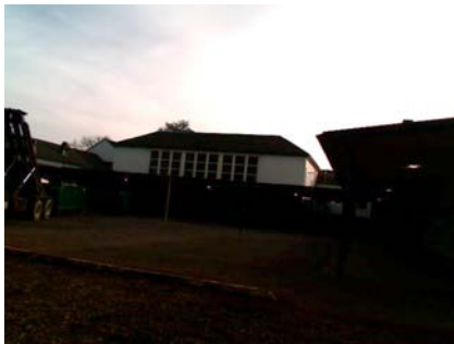
N Vertical Irregularity Primary