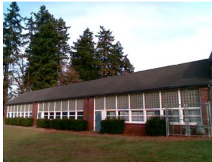
W Plan Irregularity Secondary