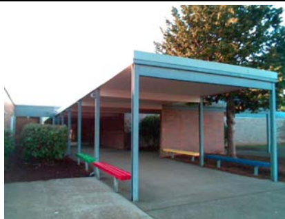
E Falling Hazard