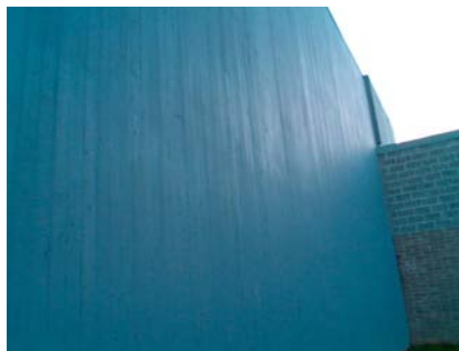
N Secondary Structural Type