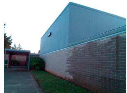
NE Primary Structural Type