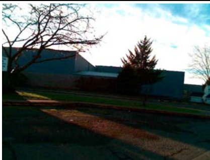
E Secondary Structural Type