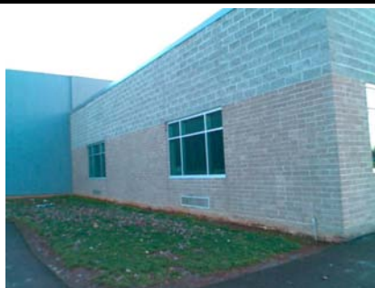
NE Plan Irregularity Primary