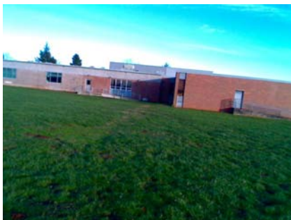
W Vertical Irregularity Secondary