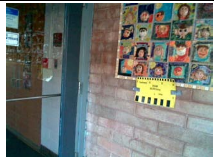
E Primary Structural Type