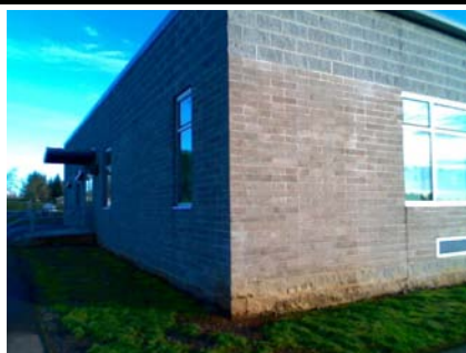
NW Primary Structural Type