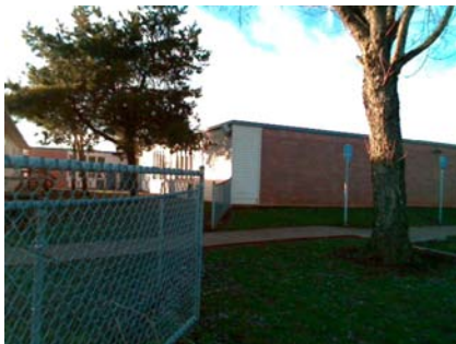
SE Secondary Structural Type