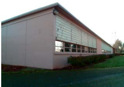
NE Elevation View