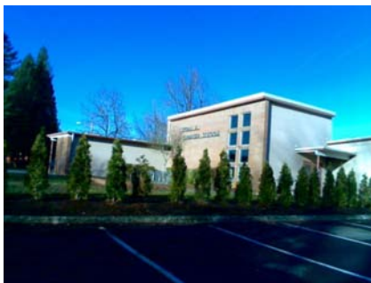
W Secondary Structural Type