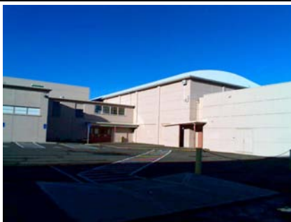
S Vertical Irregularity Primary