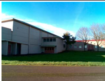
SE Plan Irregularity Secondary