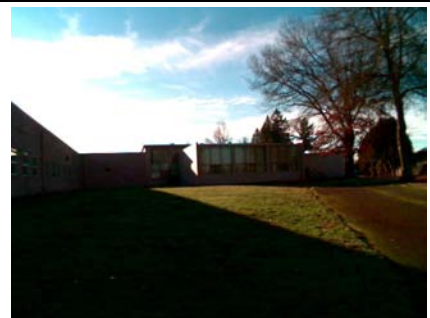
E Plan Irregularity Tertiary