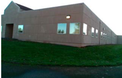
NE Plan Irregularity Primary