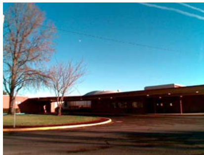
NW Falling Hazard