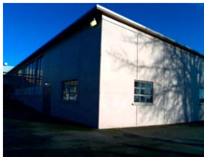
W Primary Structural Type