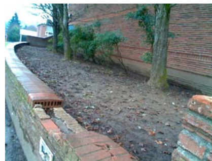
N Secondary Structural Type cavity wall const