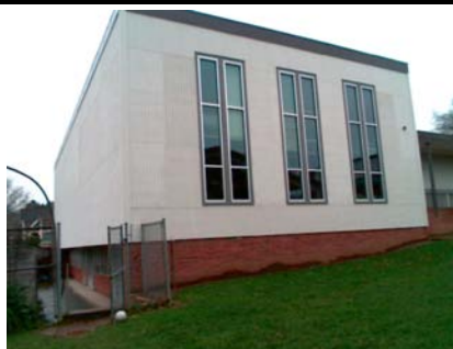
NE Number of Stories also blt on hill