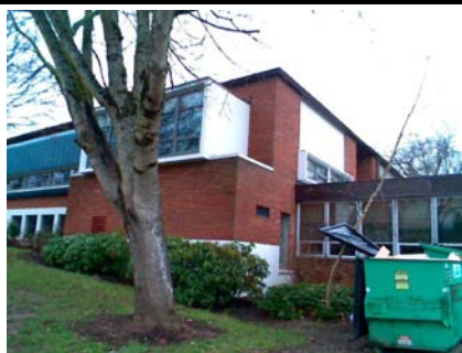
S Vertical Irregularity Secondary