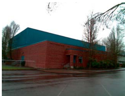
NW Plan Irregularity Primary