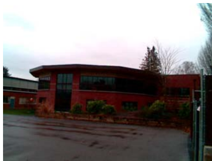
N General Site 2005 library