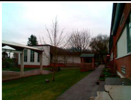
N Vertical Irregularity Secondary