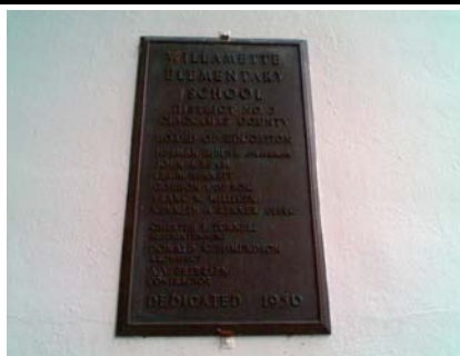
S Field Verified Year Built 1950