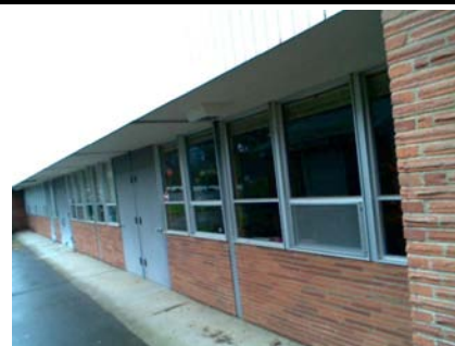
E Vertical Irregularity Tertiary wood post lateral support