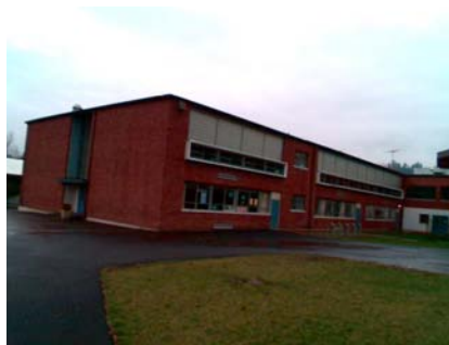
NW Elevation View