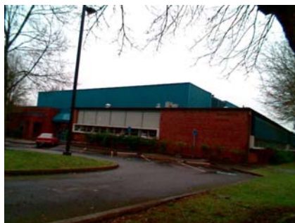
SW Vertical Irregularity Primary