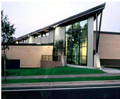
S General Site