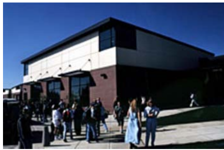
S General Site