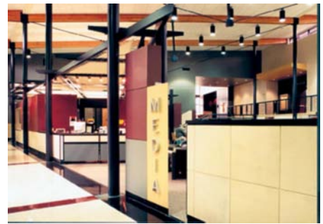
S General Site