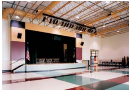
S General Site