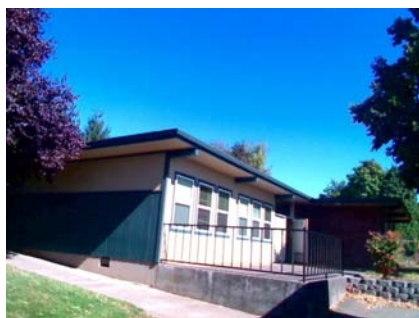
SW Plan Irregularity Primary UNIT D