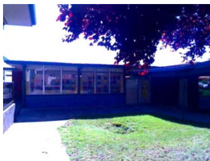
N Plan Irregularity Primary UNIT E