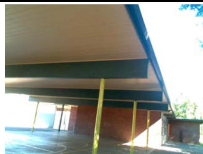
SW Pounding Potential UNIT B