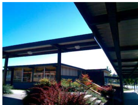
NW Plan Irregularity Primary UNIT F