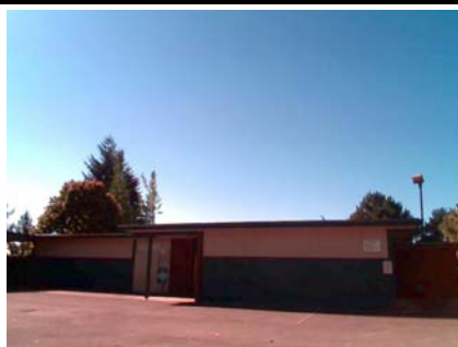
E Elevation View UNIT C