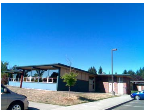
SE Plan Irregularity Primary UNIT F