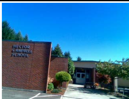
W Plan Irregularity Primary