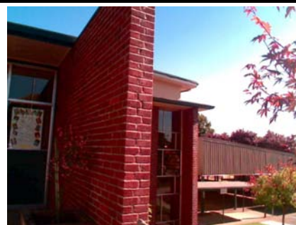
W Secondary Structural Type BRICK WALLS GO THRU