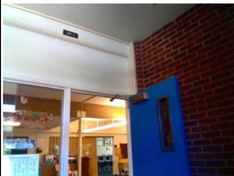
W Primary Structural Type UNIT E - OLD EXT WALL AND NEW ADDN FRAMING