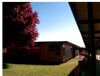
NW Falling Hazard UNIT E