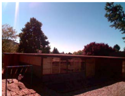
NE Elevation View UNIT D