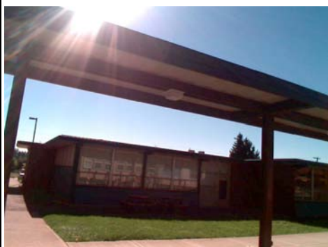
NE Elevation View UNIT F