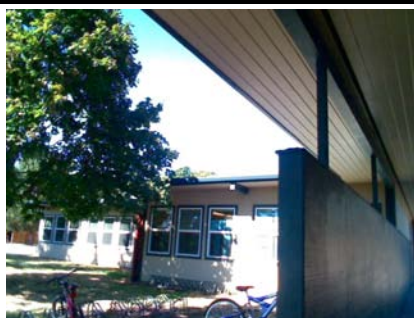
S Pounding Potential UNIT C