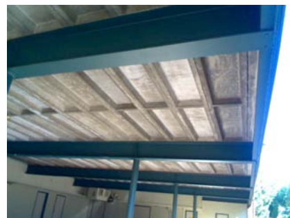
S Primary Structural Type ORIG GYM FLOOR PRECST UNITS