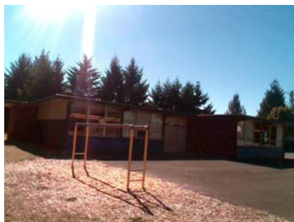
NE Plan Irregularity Primary UNIT B