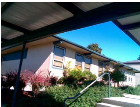
SW Elevation View UNIT E