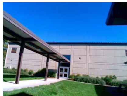
W General Site 2001 GYM