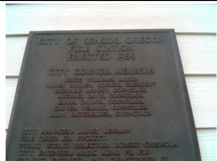
NW Field Verified Year Built 1989