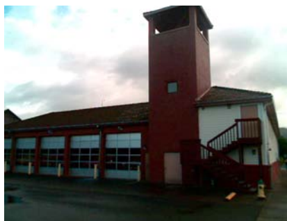
SW Elevation View