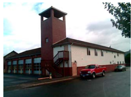
SW Elevation View