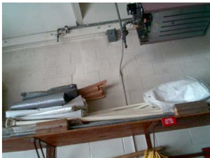
S Poor Condition