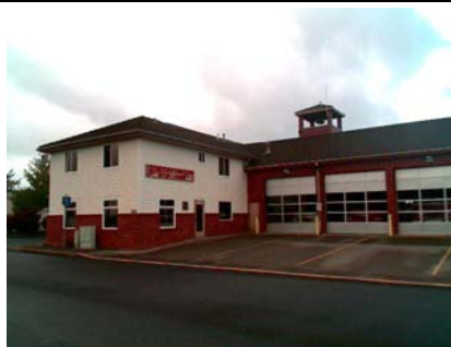
N Plan Irregularity Secondary