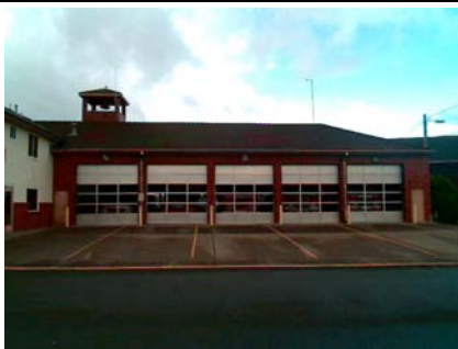
NE Plan Irregularity Secondary