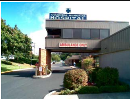
W Falling Hazard