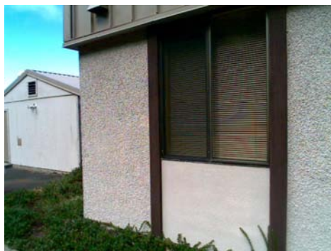
NE Primary Structural Type