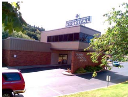
N Falling Hazard