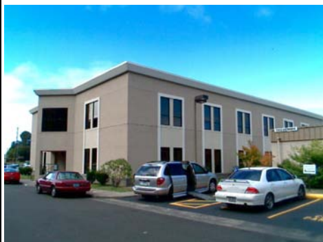
SE Other new bldg out patient only