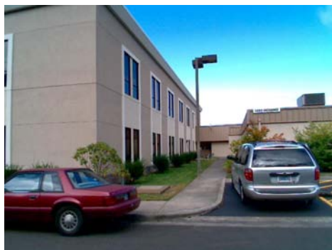
S Vertical Irregularity Primary