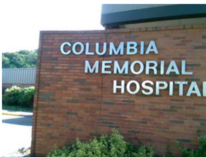
NW Poor Condition