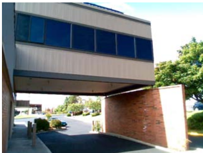
E Falling Hazard