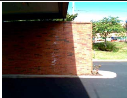
S Poor Condition