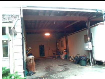
E Plan Irregularity Primary