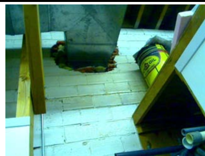
NW Secondary Structural Type