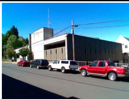
SE Vertical Irregularity Primary