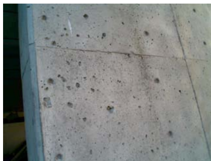
N Primary Structural Type