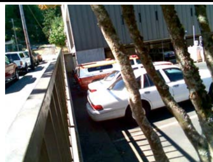
E Vertical Irregularity Secondary