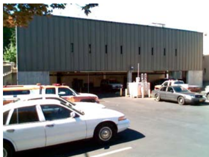
E Vertical Irregularity Tertiary