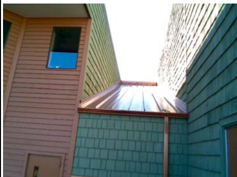
NE Vertical Irregularity Primary