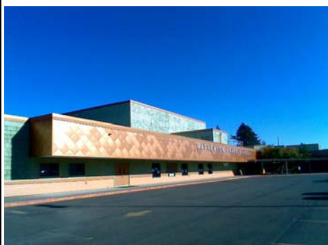
NW General Site