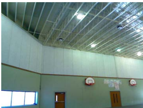
N Other covered play area