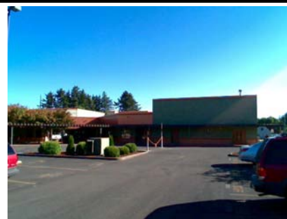
N Elevation View