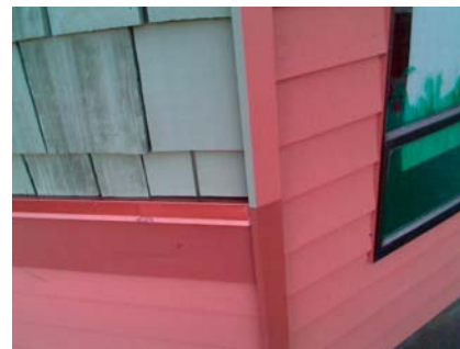
NE Primary Structural Type