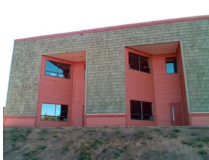
E Number of Stories