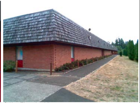
SW Elevation View