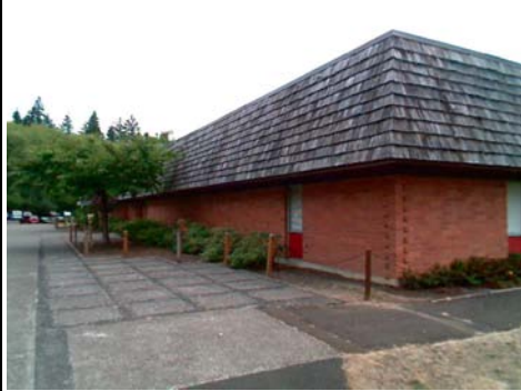
W Elevation View