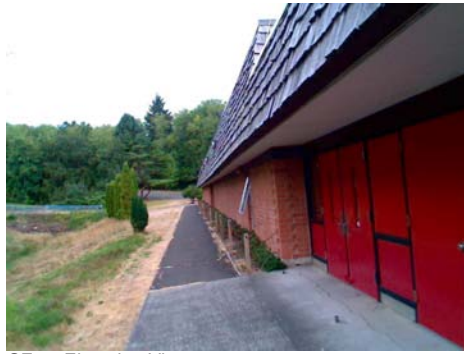
SE Elevation View