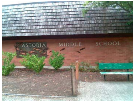
NW Building Name