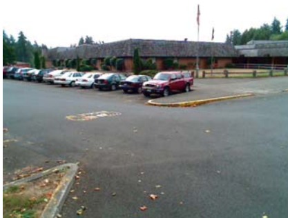
N Elevation View