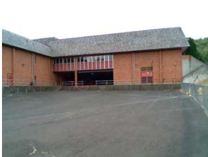
SE Elevation View