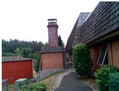
NW Falling Hazard