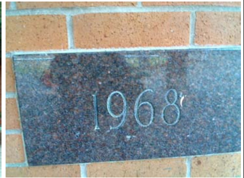
NE Field Verified Year Built 1968