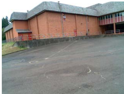
E Elevation View