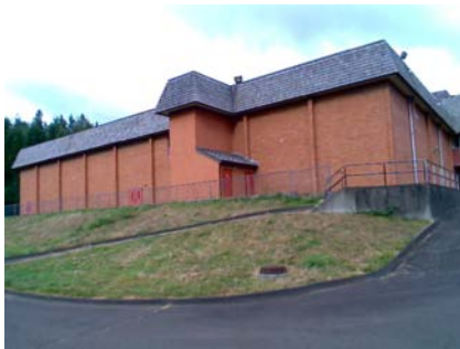
NE Elevation View