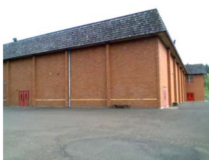
SW Elevation View