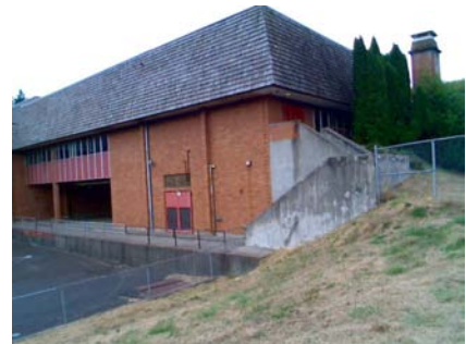
E Vertical Irregularity Primary