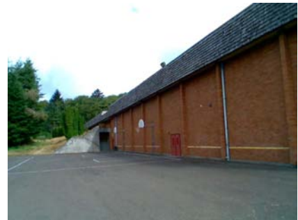
S Elevation View