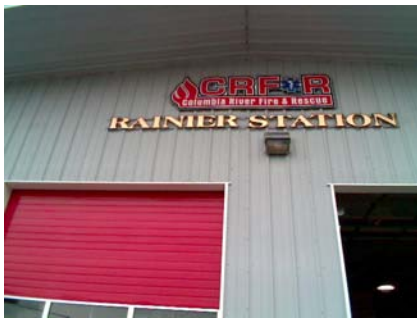
W Building Name