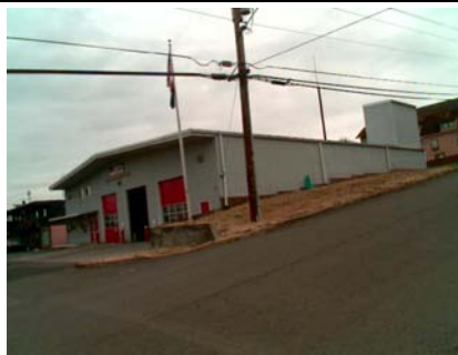
SW Vertical Irregularity Primary