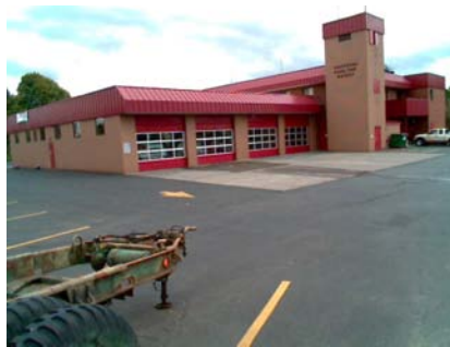
NE Plan Irregularity Primary