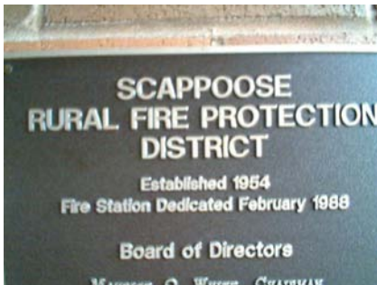
SW Field Verified Year Built 1988