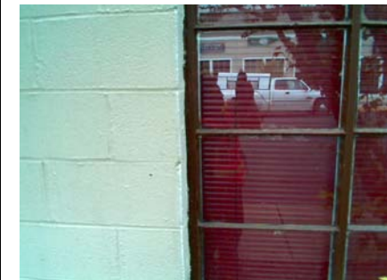
E Primary Structural Type