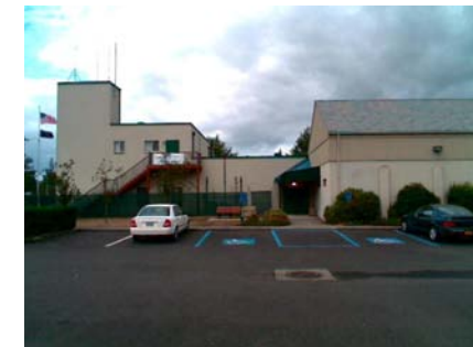
S Vertical Irregularity Primary