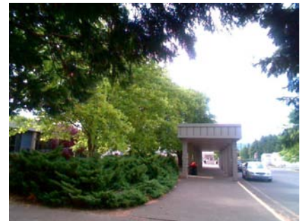
W Falling Hazard