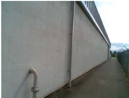
S Elevation View