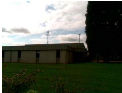
N Vertical Irregularity Primary