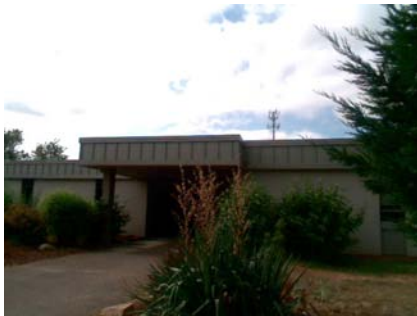
N Falling Hazard