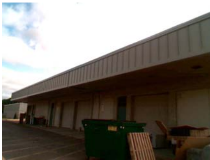
SW Elevation View