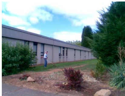
N Elevation View