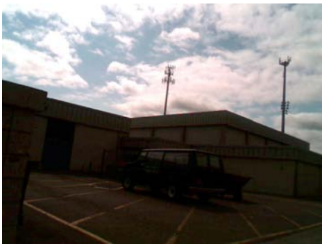
W Vertical Irregularity Primary