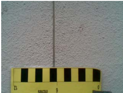
E Other jt in surface coating over hard structure