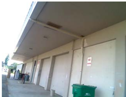
W Primary Structural Type