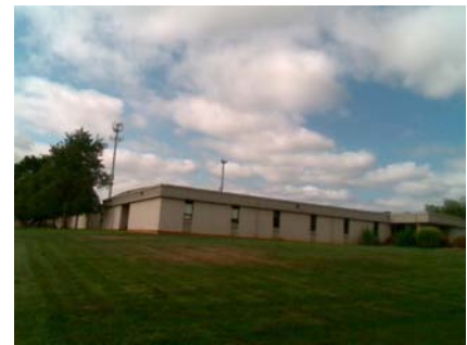
NE Plan Irregularity Primary