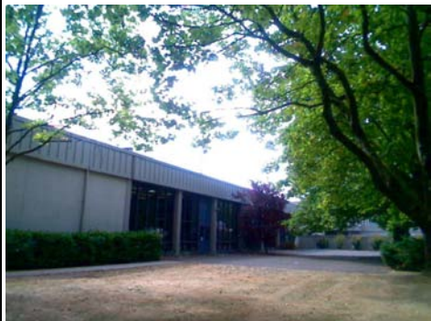
W Elevation View