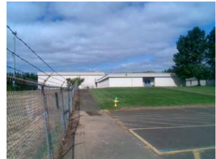
E Vertical Irregularity Primary