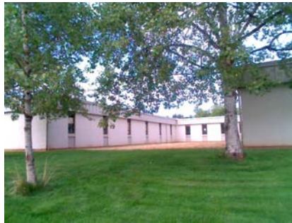
E Plan Irregularity Primary