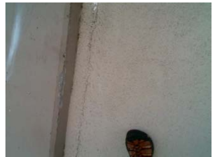
W Secondary Structural Type