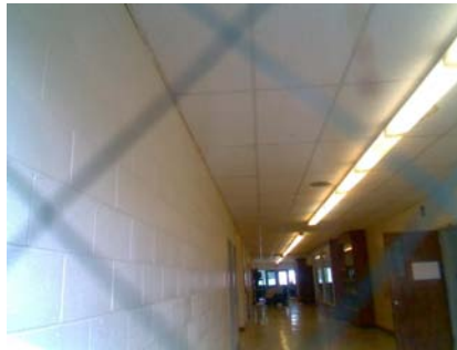
S Primary Structural Type omu in hall