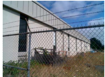
E Elevation View