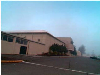
SE Vertical Irregularity Secondary