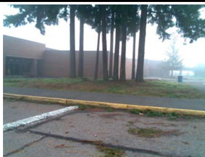
NW Plan Irregularity Primary