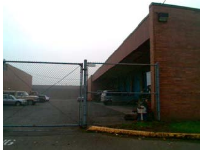
N Plan Irregularity Primary