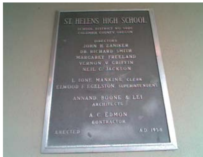
N Field Verified Year Built 1958