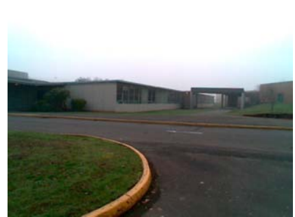
NW Plan Irregularity Tertiary