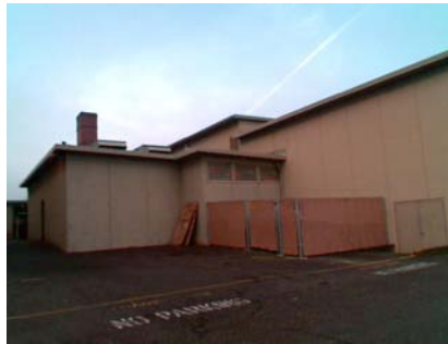
E Vertical Irregularity Primary