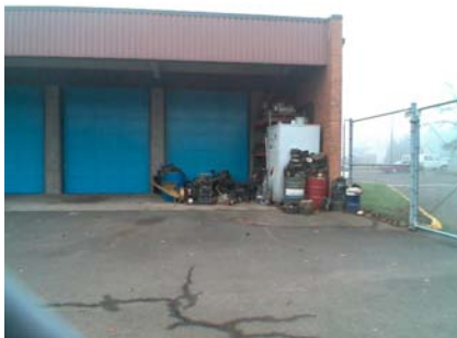
E Primary Structural Type note all-brick wing wall and conc cols between bays