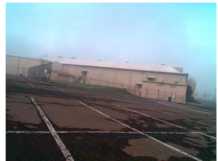
SE Vertical Irregularity Primary