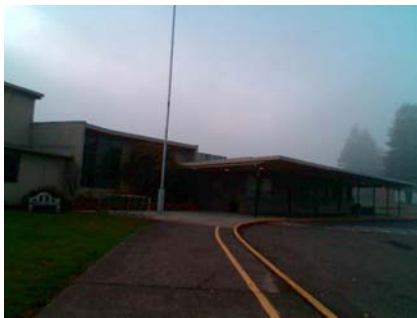
NE Falling Hazard