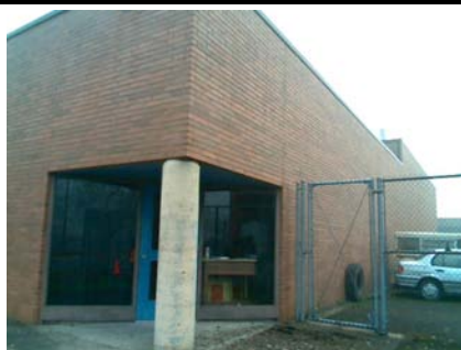
NW Primary Structural Type