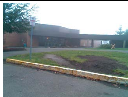
NW Plan Irregularity Primary