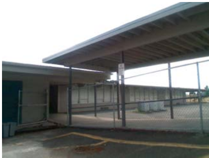
NE Plan Irregularity Primary