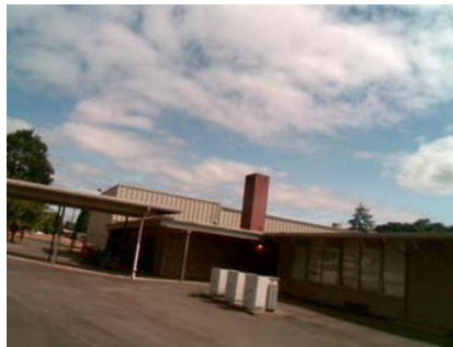
SW Falling Hazard