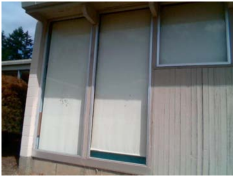
S Primary Structural Type wood/cmu