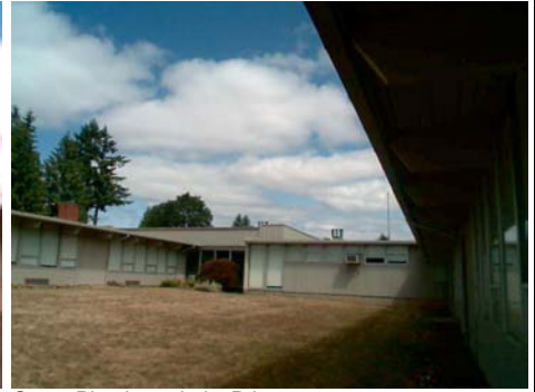
S Plan Irregularity Primary