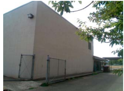
NE Elevation View no pounding