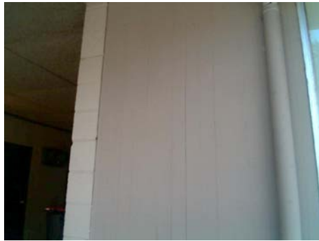
W Primary Structural Type wood/cmu