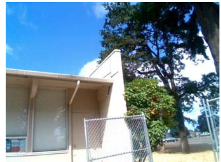
E Primary Structural Type wood/cmu transition