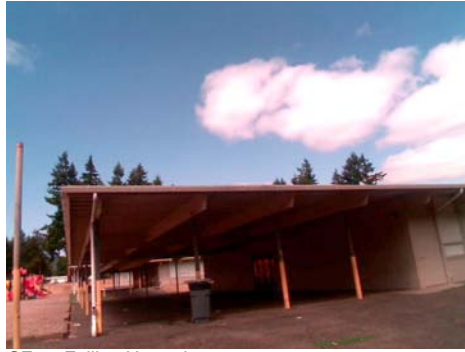
SE Falling Hazard