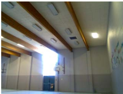
N Primary Structural Type