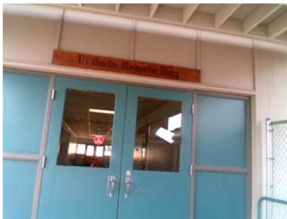
E Building Name