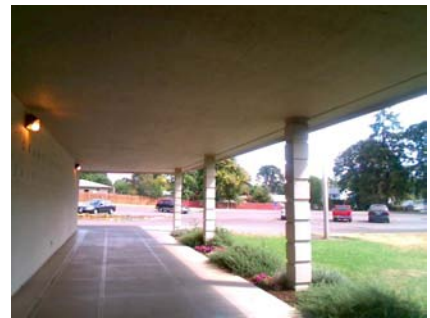
N Falling Hazard