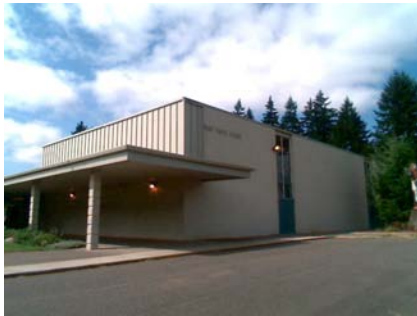
NE Vertical Irregularity Primary