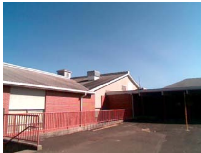
NW General Site conn to d and c