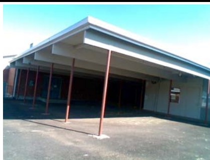
NW Falling Hazard