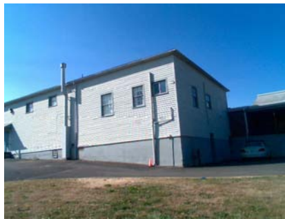
SE Vertical Irregularity Primary conn to a