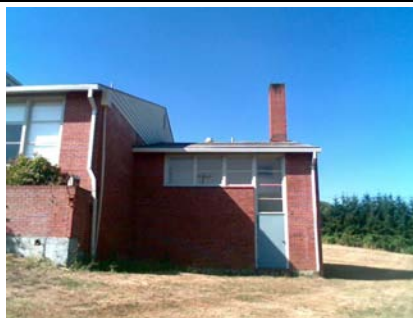
S Falling Hazard