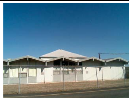
W Vertical Irregularity Primary b roof beyond