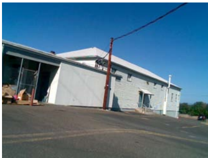
SW Vertical Irregularity Primary