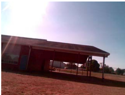
NE Primary Structural Type