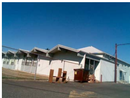
SW Elevation View