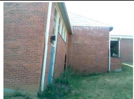
E Plan Irregularity Primary