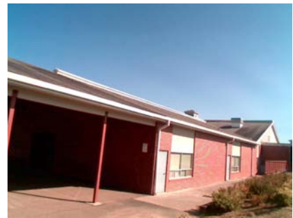
NW Elevation View no vert irr