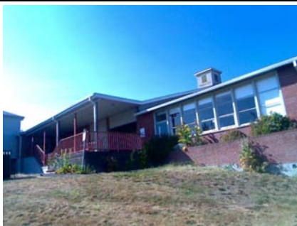
SE Vertical Irregularity Tertiary