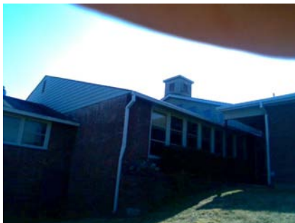
NE Elevation View conn to d