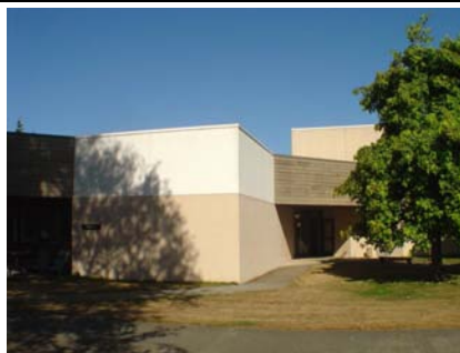
W Vertical Irregularity Primary