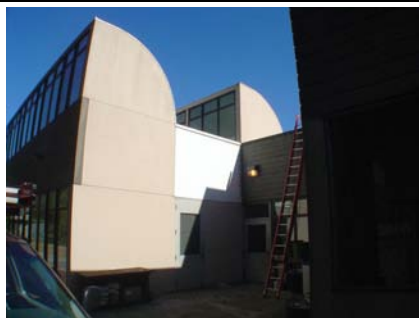
N Vertical Irregularity Primary