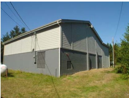
SW General Site