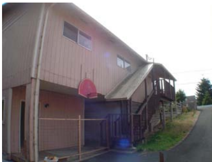
N Vertical Irregularity Primary sloped site