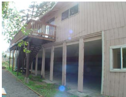
E General Site