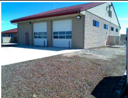
SW General Site