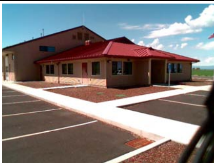
NE Plan Irregularity Primary