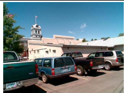
SW Falling Hazard