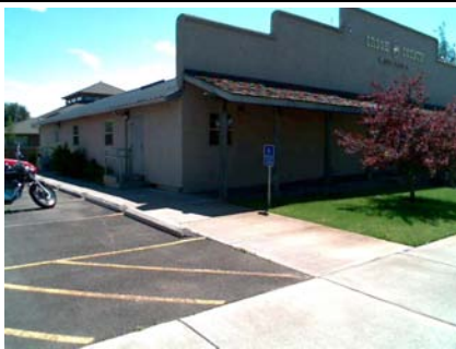
NE General Site