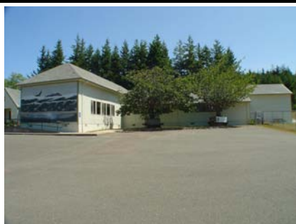
SW Plan Irregularity Primary