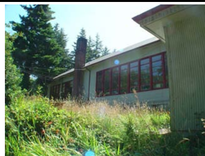
N General Site