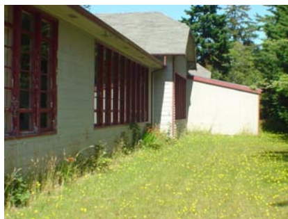
E Plan Irregularity Secondary