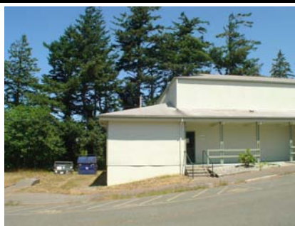
SW Vertical Irregularity Primary