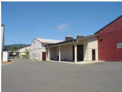
N General Site