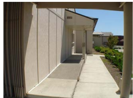
N Plan Irregularity Secondary