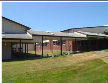
S Plan Irregularity Primary