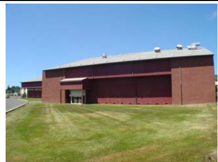
W General Site