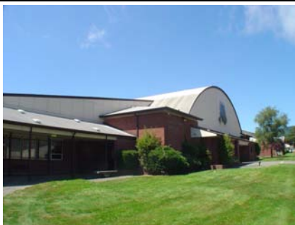
S Vertical Irregularity Primary