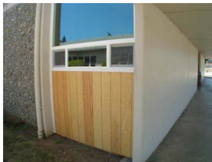
E Tertiary Structural Type