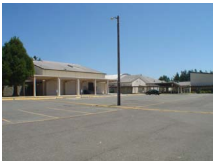
N General Site