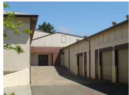
N Vertical Irregularity Primary