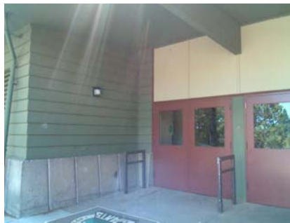
NW Plan Irregularity Primary