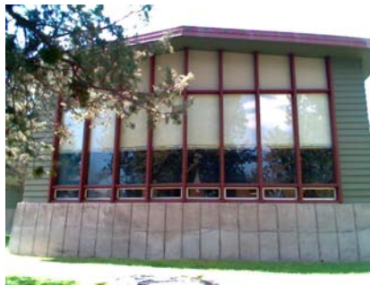
N Plan Irregularity Secondary