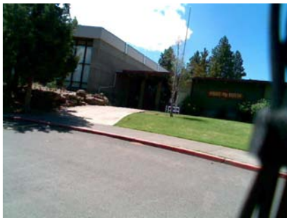
NW Vertical Irregularity Primary