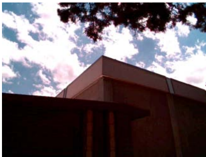
W Vertical Irregularity Primary