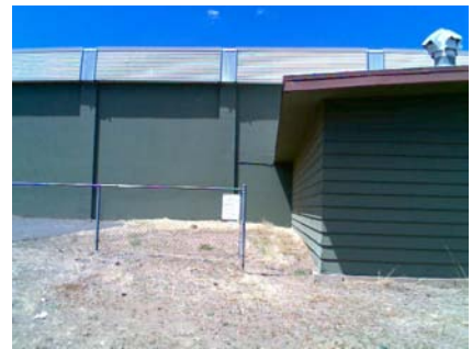
E Plan Irregularity Secondary