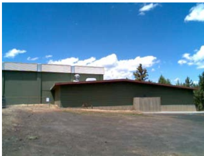
E Vertical Irregularity Primary