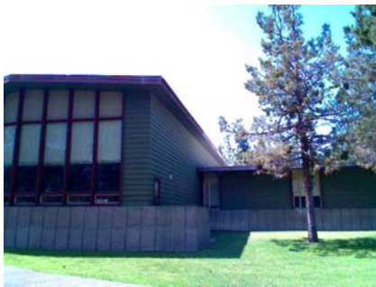
N Vertical Irregularity Primary