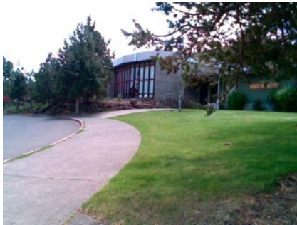
NW Plan Irregularity Secondary