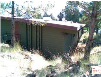
SW Elevation View