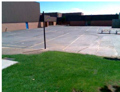
NW Plan Irregularity Primary