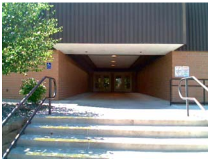
E Falling Hazard