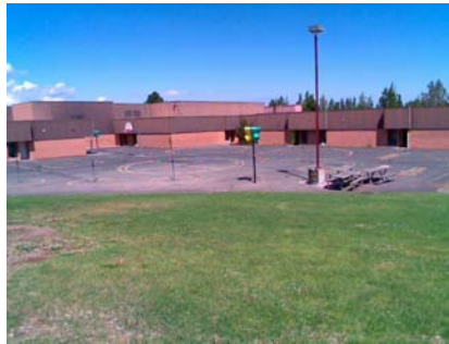
NW General Site