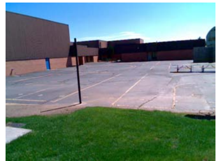
NW Vertical Irregularity Primary