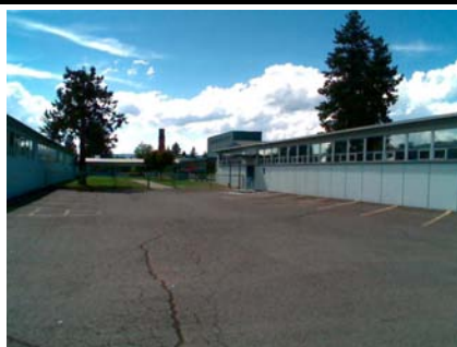
SE Vertical Irregularity Primary