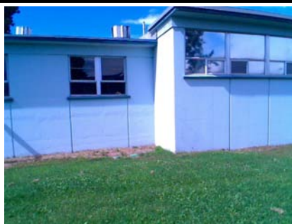
SW Plan Irregularity Primary