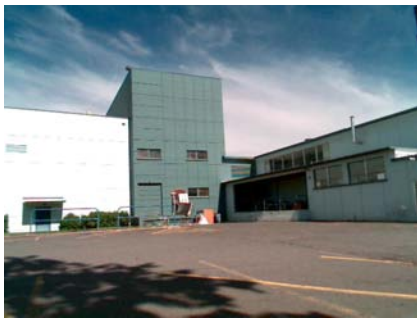
W Vertical Irregularity Primary