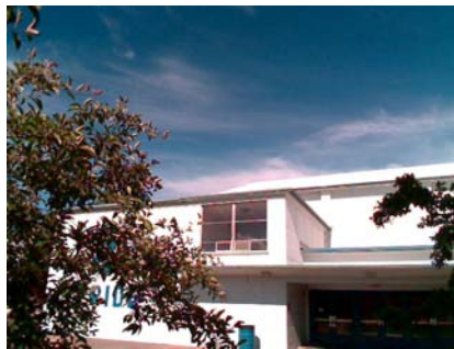
SW Vertical Irregularity Primary