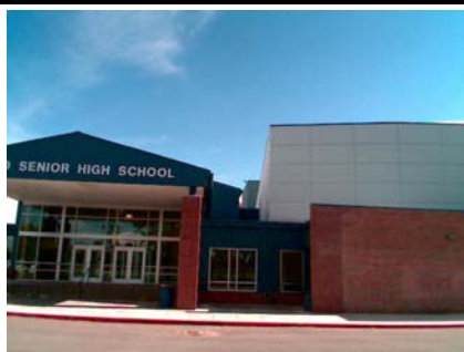
N Vertical Irregularity Primary