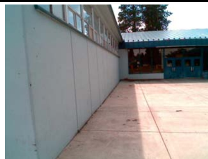
NE Plan Irregularity Secondary