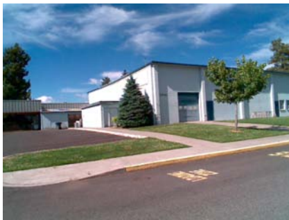
SW General Site