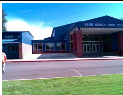
NE Plan Irregularity Primary