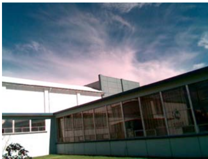
NW Vertical Irregularity Secondary