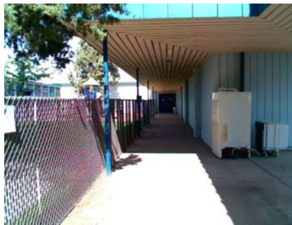
NE Plan Irregularity Secondary