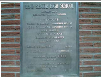
W Field Verified Year Built