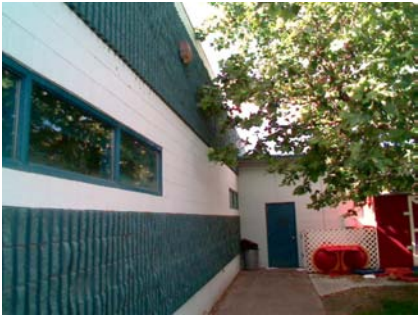
SE Vertical Irregularity Primary