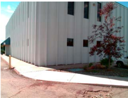
SE General Site