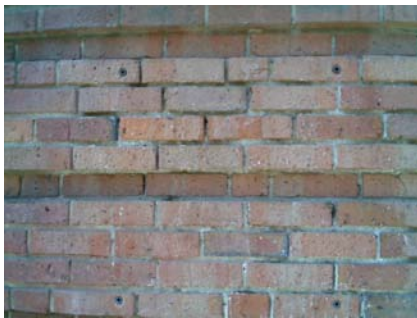
E Primary Structural Type headers forming an english bond