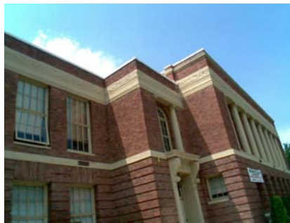
SE Falling Hazard cornice _parapet