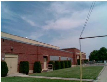
SW General Site Irregularities